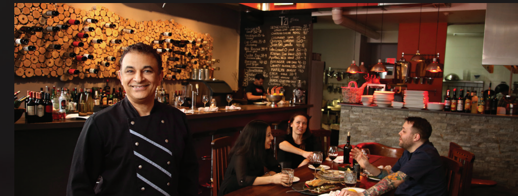
Table 21 Steakhouse and Oyster Bar

800 Cumberland St., Cornwall, ON K6J 417, (613) 936-0322, www.eightzerozero.ca