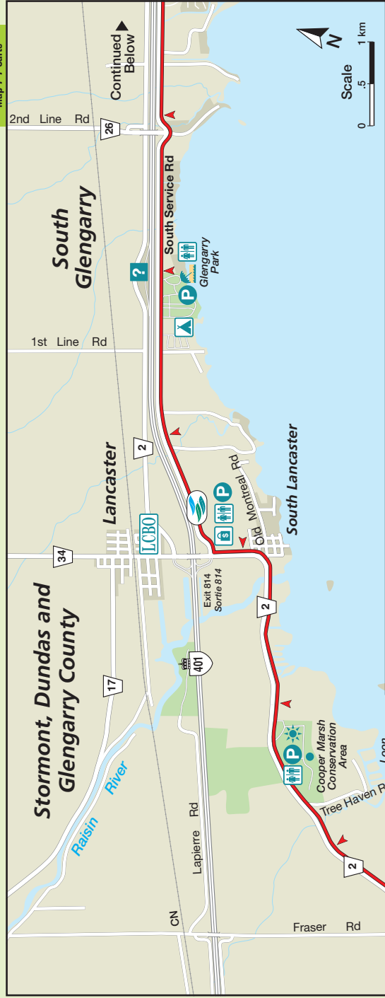
Map 7-7: Lancaster